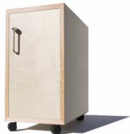
Timeless Danish Design Patented high quality furniture

The objective of COCOON is to generally improve the office atmosphere, hide the often unattractive PCs and provide enhanced security for an important everyday resource.