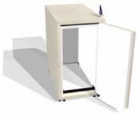
Aesthetic PC Furniture The unique solution

COCOON is revolutionary PC furniture, designed to bring unmatched noise reduction, physical protection of the PC, and unique aesthetics to the modern office environment.