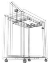
An Ergonomic Vision 3 years experience